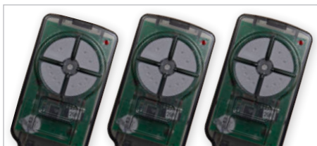
Three TrioCode™128 Remote Controls

^ When maximum spring balanced weight is 20kg.