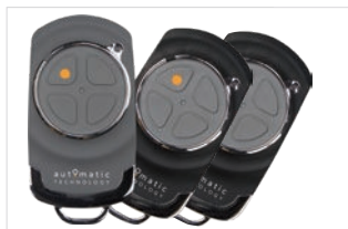
Three TrioCode™128 Remote Controls

^ When maximum spring balanced weight is 20kg.