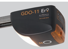
Opener with Courtesy Light