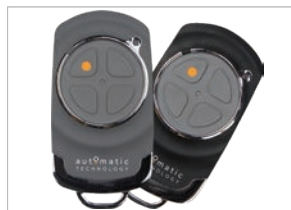
Two TrioCode™ 128 Remote Controls

*When maximum spring balanced weight is 20kg.