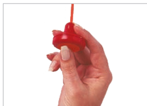
Easy Access Transmitter to open and close the door from within the garage