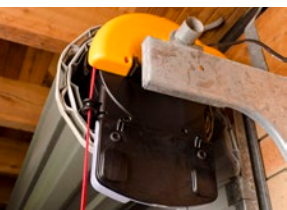
Opener with LED Courtesy Lights